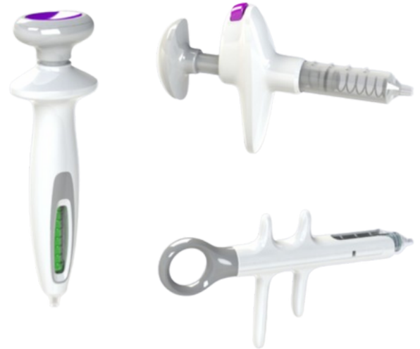
Sinuplasty Balloon Inflator